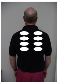
Chest Compression and Clapping - Target Areas for the Back

This motion traps the air between the hand and the chest wall. The sudden compression of air produces an energy wave that is transmitted through the chest wall, producing an energy wave that is transmitted through the chest wall tissue to the lung tissue. The energy wave will loosen mucus plugs and allow better movement of secretions by gravity and coughing techniques.