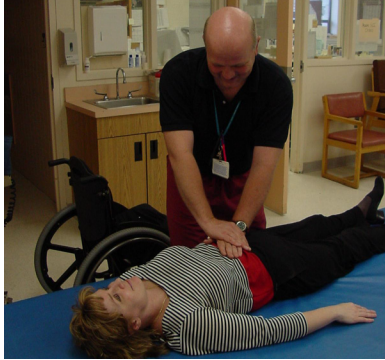
Quad Assisted Cough

Another way to help keep the airways clear is the quad assist cough. The quad assist cough is a way of working with the person who has a minimal cough. This procedure makes it easier to cough up the secretions that have accumulated in the lungs. Quad assisted coughing is done by placing the heel of the hand on the person's diaphragm. The person is asked to take a deep breath. The assistant pushes forcefully on the diaphragm in an upward and inward motion toward the shoulders. This motion helps to provide forced exhalation and the movement of secretions. The procedure is repeated until the person has cleared his or her airway or is tired. If the person is tired, and all secretions are not removed, then suctioning may be necessary.